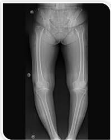
LONG FILM X-RAY