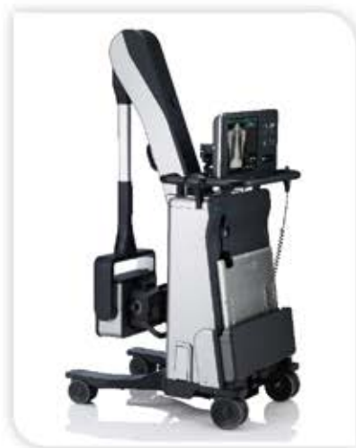
DIGITAL PORTABLE X-RAY MACHINE